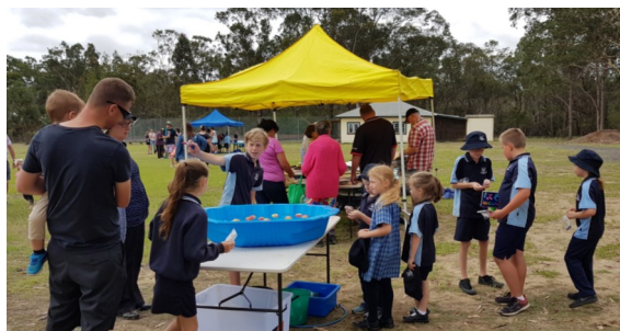
Year 6 Fair ~ Friday 16th November