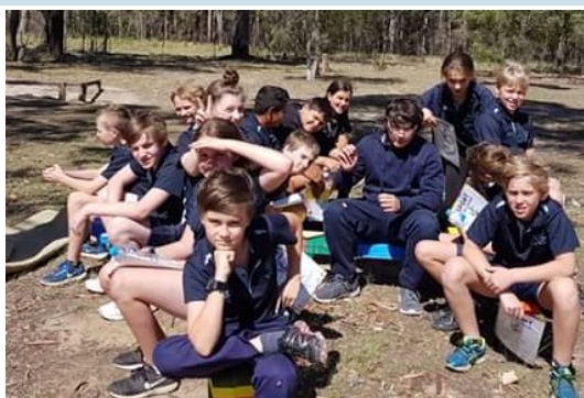
Year 6 and Their Buddy Bench Gift

PLEASE NOTE ~ IF YOU ARE DROPPING OFF YOUR CHILD'S LUNCH ORDER DIRECTLY TO PIG OUT CAFÉ ON WEDNESDAYS, THESE NEED TO BE THERE BY 10AM TO ENABLE THE STAFF TO COMPLETE THE ORDER IN TIME FOR OUR LUNCH RUN PICKUP