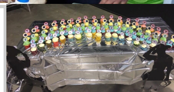
Year 6 Farewell Cakes

A range of school holiday activities will be held at Cessnock and Kurri Kurri Libraries. A poster is on display in the school office or, you can go to their website www.cessnock.nsw.gov.au for full details. Cessnock Library contact is 4993 4399 and, Kurri Kurri Library contact is 4937 1638