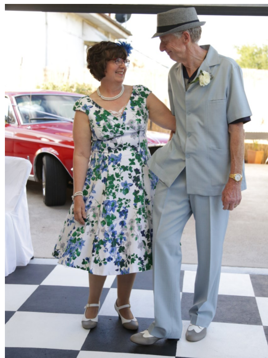
Rock n Roll Dance After the Ceremony

The weather was perfect for this most special, relaxed, enjoyable day.