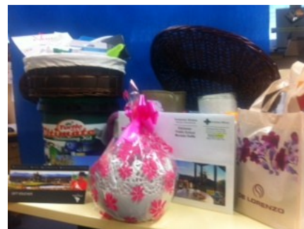
Just Some of the Prizes

Monster Raffle – We are having a Monster Raffle again this year. We are organising donations and have quite a collection in the school office. There are gift vouchers, house decoration items, non perishable goods and various other items. If you have a business or know of someone that may be willing to donate vouchers or goods to our Monster Raffle, please let us know. Sold raffle tickets (ensure names and phone numbers are on tickets) can be returned to the school office up until Wednesday 11th December.