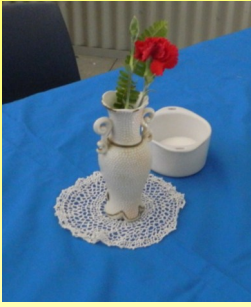
Morning Tea for 60 Grandparents/ accompanying parents.