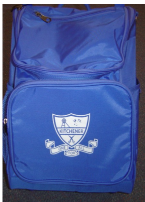
Mighty Tuffpack School Back Pack $35.00