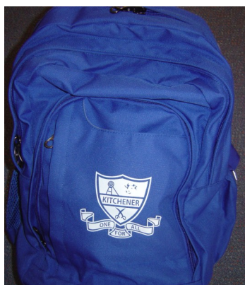
Osteo Snr School Back Pack $55.00