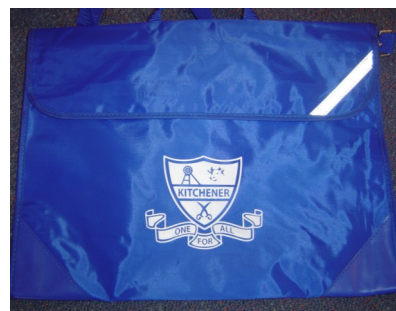
Library/Home Reader Bag $10.00

We have two School Back Packs and a Library/Home Reader Bag on display in the foyer of the school office. Each new Kindergarten student will be given a Library/Home Reader Bag when they commence school each year. Library bags can also be purchased for current students. We also have 2 School Back Packs on display. Both these items are in our school colour, complete with the Kitchener School logo are tough and durable and have a 15 year warranty. The larger bag has multiple compartments, is made of a more durable material and would suit older students. The smaller, medium-sized bag would suit all students. The library bag and both back packs bags are on display in the school office foyer.